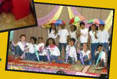
▶ Enacting a play